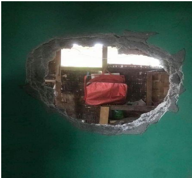
A house at 500-Acre quarter in Loikaw damaged by artillery fire on June 26

Between June 22 and July 4, at least 50 houses, mostly shops, in Demawso town were damaged by SAC troops, who broke down doors, smashed up the contents, and stole valuables.