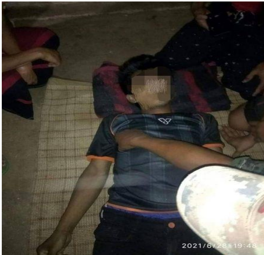
Dead body of the young man shot dead by LIB 422 while riding a motorbike on June 28

During the two weeks between June 22 to July 4, 12 people were killed, including a young man shot dead by troops of SAC LIB 422 while driving a motorbike from Moebye town to Pekhon town in the evening of June 28.