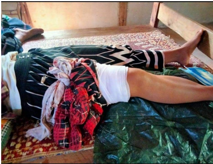
A woman from Htee Por Hso village was injured by SAC shelling.

On August 12, SAC troops clashed with KNPP/KNDF troops near Htee Klu Daw village in Pruso township. Five SAC soldiers were killed and three were injured. During this clash, KNDF reported that they seized some small guns and one mortar from the SAC. After this, on the same day, SAC troops started deploying more soldiers in and around Pruso town. A clash took place near Kadah Lah village, close to Pruso town, between SAC and KNPP/KNDF troops. LIB 102 and LIB 531 based in Demawso township launched artillery shells to support their troops in Pruso township, injuring a woman from Htee Por Hso village in Pruso township in her thigh, and a male villager in his arm from Nyow Khone village, Demawso Township.