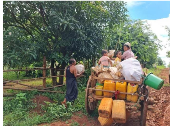
Villagers flee from clashes near Dawtahay village

On August 22, at 7:30 am, SAC troops clashed for about ten minutes with combined KNPP and KNDF troops between Bawlake town and Mae Salong mountain. Three SAC soldiers were killed and two were injured. During the operation in this area the SAC has been using drones to conduct surveillance.