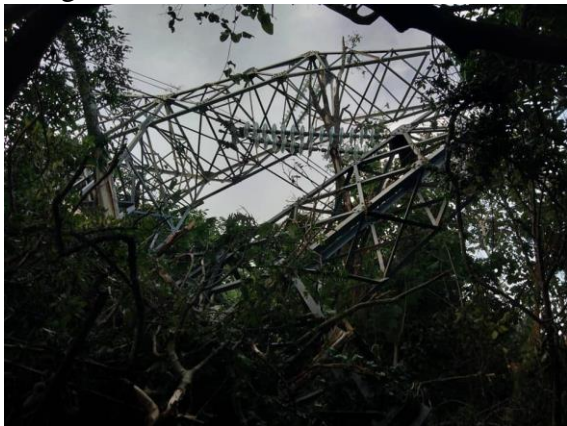
An electric pylon demolished by PDF-Pekhon

The No 3 hydropower station in Lawpita, also known as Lawpita 3, is connected to the military capital Naypyitaw through transmission lines and pylons. Two of the pylons near Loi Hweh village, between Pinlaung township and Pekhon township, were blown up by PDF Pekhon, one of the KNDF members, on August 12, 2021, according to a PDF-Pekhon statement. After that, on August 18, about 300 SAC and PNO troops from Pinlaung township entered Pekhon township and based themselves at Pin Pong village monastery, from where they fired multiple artillery shells to the northeast, which destroyed some houses in Loi Hweh village.