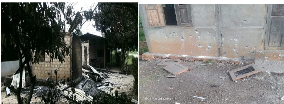
Houses damaged by SAC shells in Demawso township

On September 7, at 3 pm, a clash took place near Daw Poe Si village between Loikaw township and Demawso township. At 5 pm, another clash took place between 5-mile and 6-mile villages in Demawso township. Four SAC soldiers were killed in these clashes, according to a KNDF statement. After these clashes, the SAC fired artillery shells which damaged six houses and caused four houses to burn down in 6-mile village, and damaged at least four houses in Daw Hseh village, injuring one small child. A group of villagers fleeing the fighting in a car had an accident which killed one of the passengers, an eight-year-old child. On the same day, the KNPP and KNDF troops ambushed Demawso police station, but SAC forces kept control of the station.