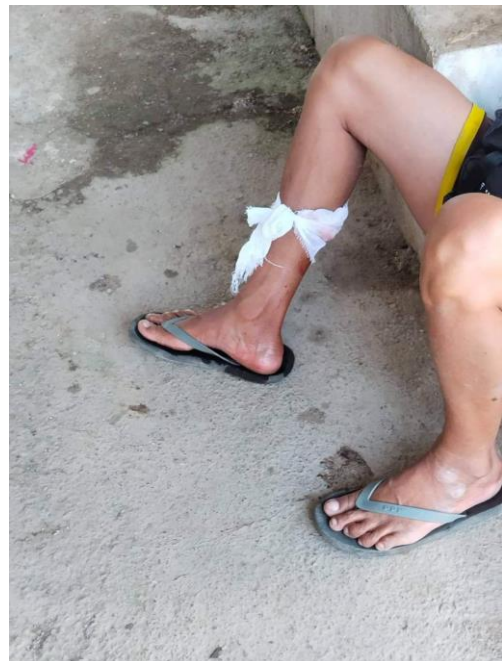
Injured villager from Ye Ni Kan, Loikaw Villager from Gone Thar injured by SAC artillery