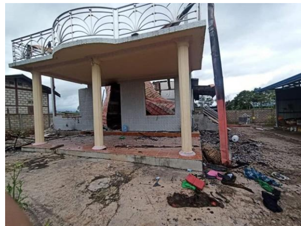
Houses burnt down by SAC on Sept 25-26 in Thay Hsu Leh and Gone Thar villages, Demawso