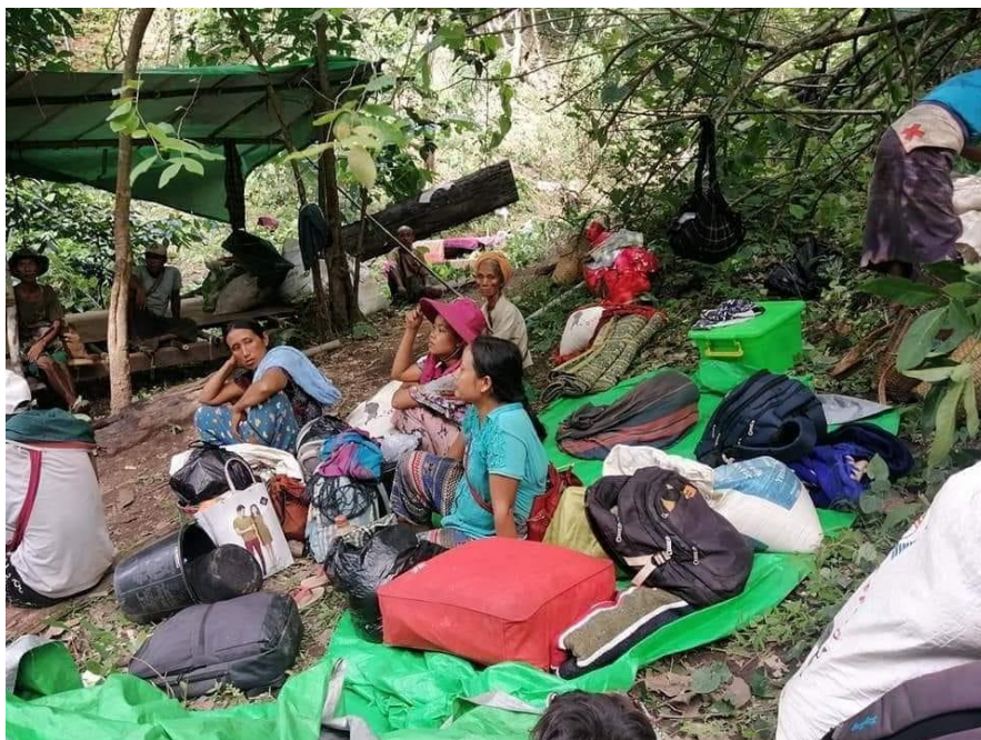
New IDPs in Nan Peh village tract.

hide in the surrounding jungle. The SAC troops also entered Nan Peh village and broke windows and front doors of villagers' houses