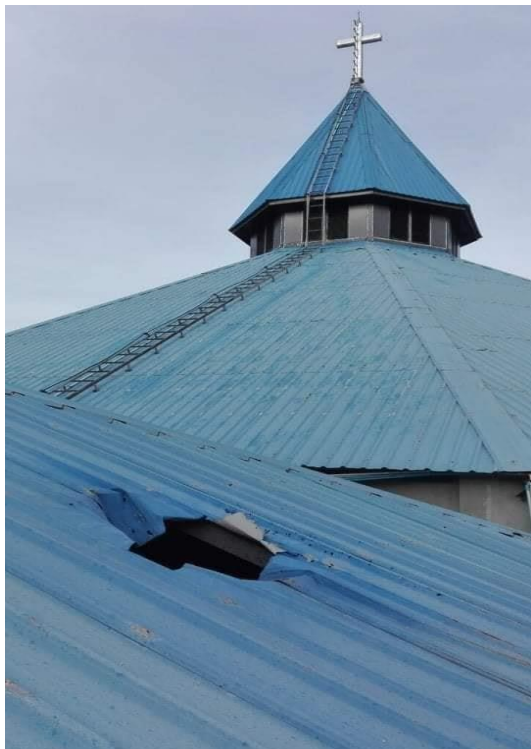
Mae Taw church in Pruso town, damaged by SAC shelling

On October 24, Moebye PDF and KNDF ambushed a convoy of SAC military trucks which were travelling from Loikaw to Pekhon, killing ten SAC troops and injuring several. After this, at 7 am the Moebye-based LIB 422 fired artillery shells into Moebye town, fatally injuring a woman in the head, and injuring six other civilians, including children.