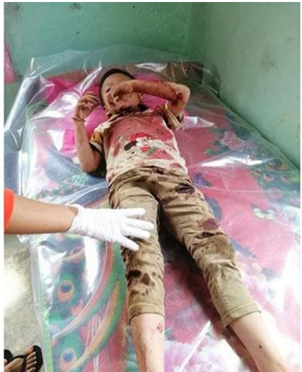
Children were injured by SAC shelling, Pekhon Township