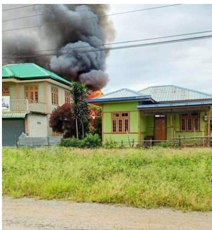
Houses set on fire by SAC in Demawso

On October 14, SAC torched two houses in Daw Khlent Li village in Demawso township. On the same day, SAC troops carrying out clearance operations in 6-Mile village, Bethle village and Walatwan village in Demawso were targeted by mines laid by KNDF, which killed three SAC troops and injured four. SAC and KNPP troops also clashed between Nam Ku village and Pan Pu village in Pasaung township.