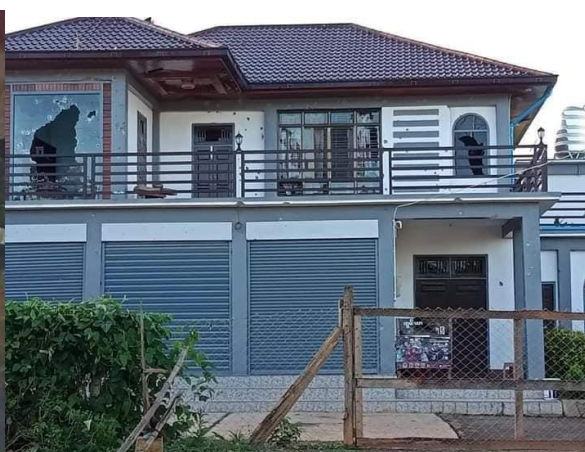
A house in Gone Thar village damaged by artillery shells

On September 30, SAC troops and combined Karenni troops clashed in Gone Thar village in Loikaw Township at 2 pm for 10 minutes. The SAC took control of a mountain outside Gone Thar village and shot into the village with artillery and small guns, damaging 10 houses.