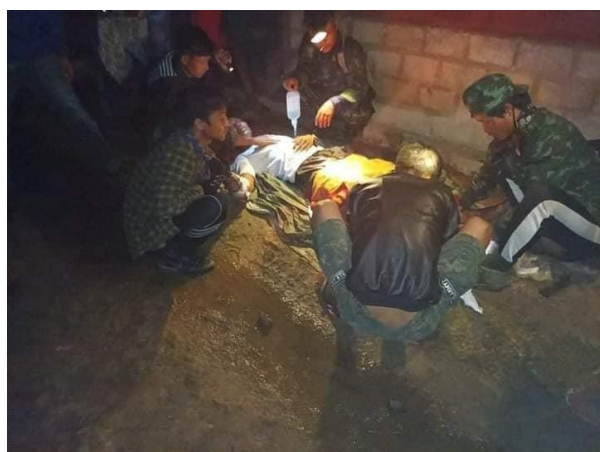
A Thay Hsu Leh villager stepped on a land mine planted by SAC

On September 29, a villager from Thay Hsu Leh village IDP camp in Demawso township, stepped on a land mine planted by SAC and was seriously injured while he was trying to collect rations from his house.