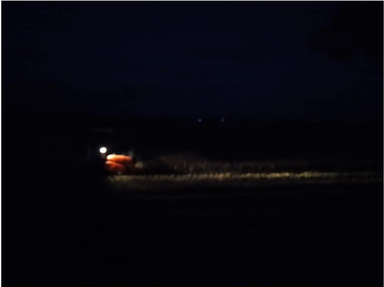
Moebye farmers harvesting their paddy at night