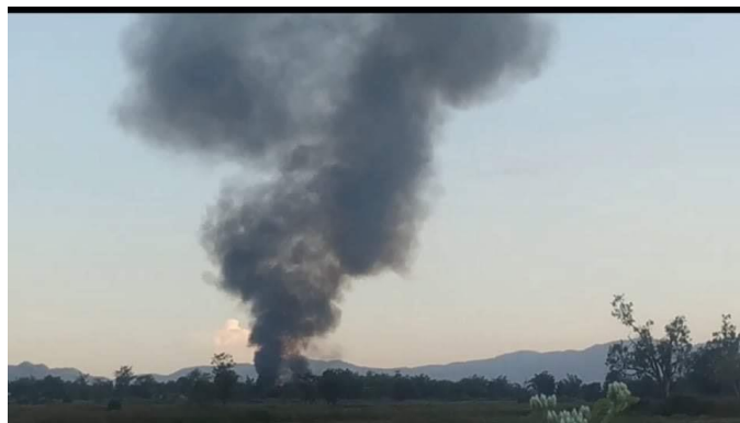
Houses burning due to SAC shelling in Demawso township

On November 9, the SAC indiscriminately fired artillery shells into Pekhon town. The shells hit Pekhon's main market, damaging some shops. They also hit and damaged Shwe Nalonedaw Catholic church, and a priest's car in the church compound. Two unexploded motor shells were later found in the compound. The shelling also damaged some houses outside the church.