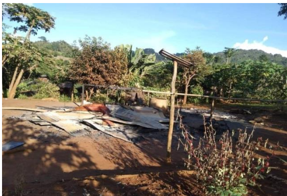
Houses torched by SAC in La Tu village, Pekhon township

On November 8, near La Tu village, Kaung Ee village tract in Pekhon township, SAC troops clashed with combined Karenni troops from KA, KNDF, Pekhon PDF and Moe Bye PDF. After the clash, the SAC burned down and destroyed 30 houses in La Tu new village. The SAC also burned down 3 houses in Loi Hweh village in Pekhon township.