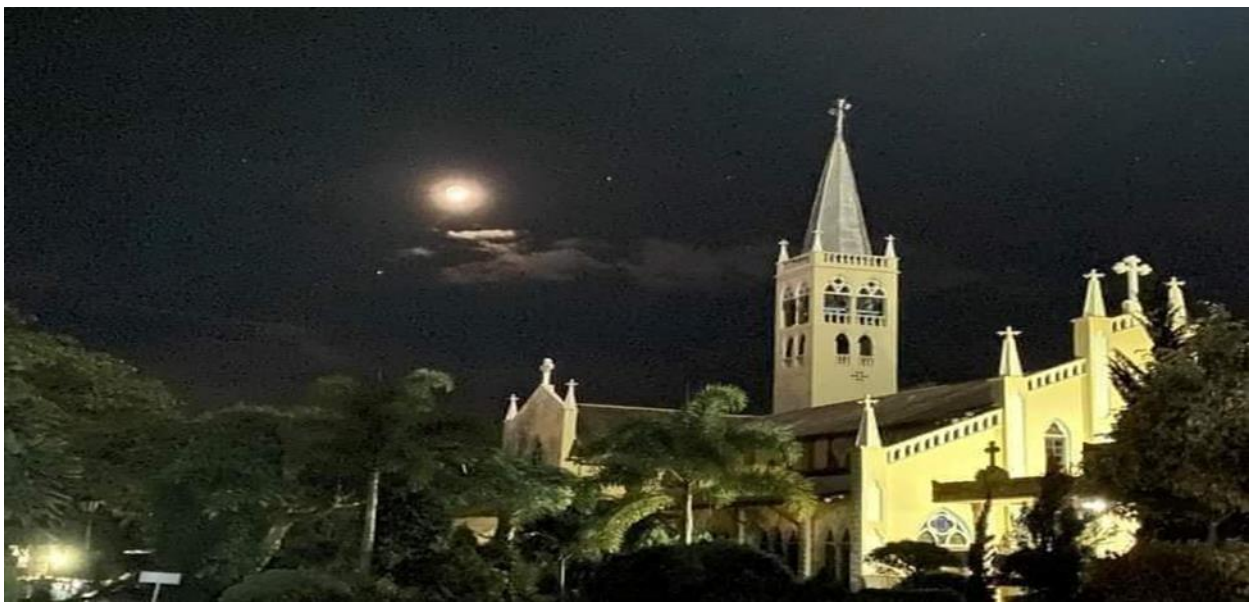
Christu King Church that was raided by SAC soldiers and police

On November 22, a large number of SAC soldiers and police searched Christu King Church in Naung Yan quarter, Loikaw town, as well as the Karuna clinic in the church compound, and arrested 18 volunteer workers, including Catholic sisters, from the clinic. Moreover, they moved patients, including Covid patients, to Loikaw government hospital and locked up the clinic. The 18 clinic volunteers arrested on November 22 were released on November 23 at 6 pm.