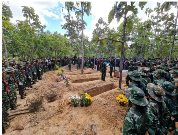
Funeral ceremony for 4 KNDF soldiers

On November 25, KA and KNDF troops had four clashes with SAC troops near Pon Chaung village in Shadaw township, and one clash on November 26. During the clashes, three SAC soldiers were injured. 3 nearby villages with 309 households fled from the clashes.