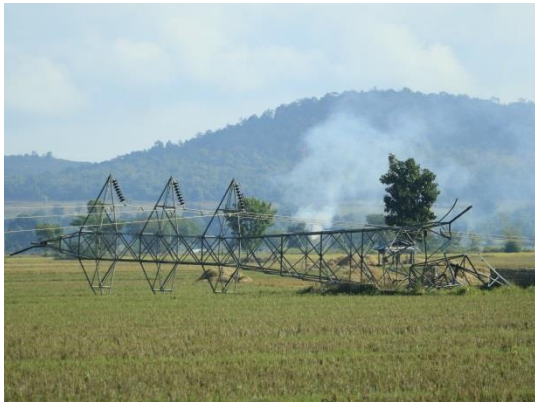
Electric pylons that were blown up

On November 25, two electric pylons between Hsaw Kee Daw and Daw Lo Shay in Loikaw township were blown up. These two pylons carried the transmission line from No 1 Lawpita Electric Power station to the cities of Naypyidaw, Mandalay and Rangoon.