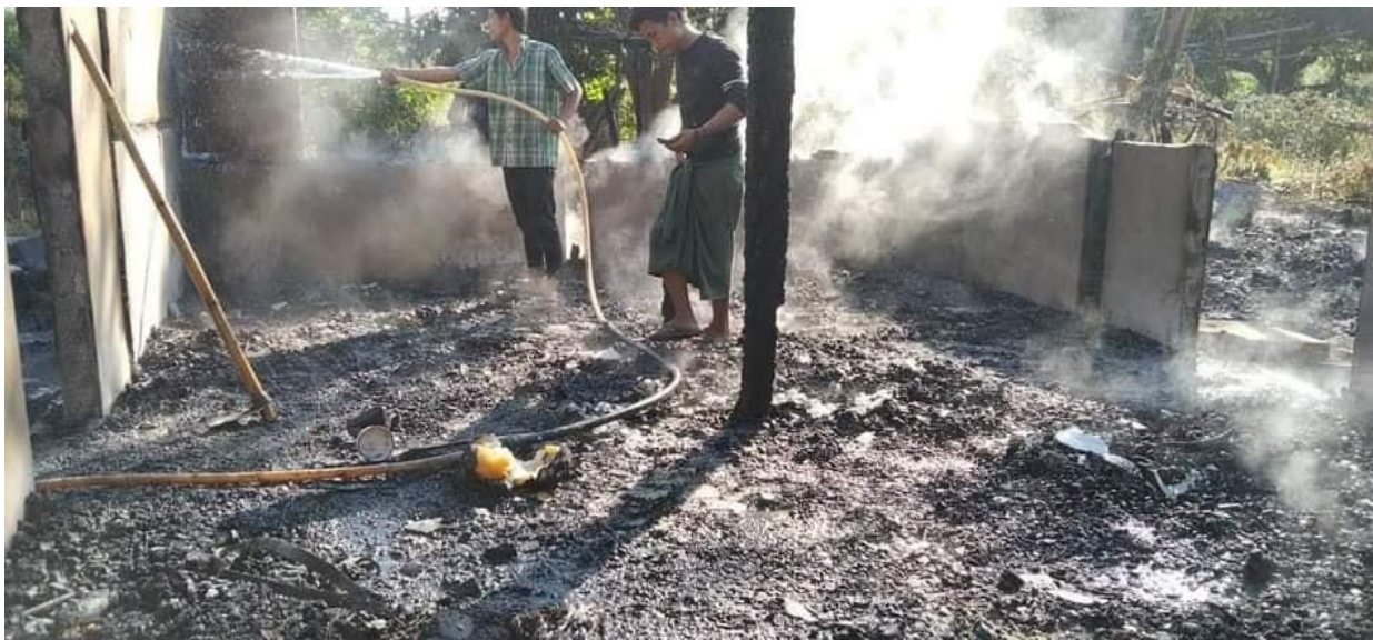
A house in Pruso township was burnt to ashes

On the same day, SAC troops clashed with combined KA and KNDF troops while carrying out clearance operations near the bottom of Mae Salaung mountain near Nan Peh village in Bawlake township. During the clash, 3 SAC soldiers were killed and 2 were injured.