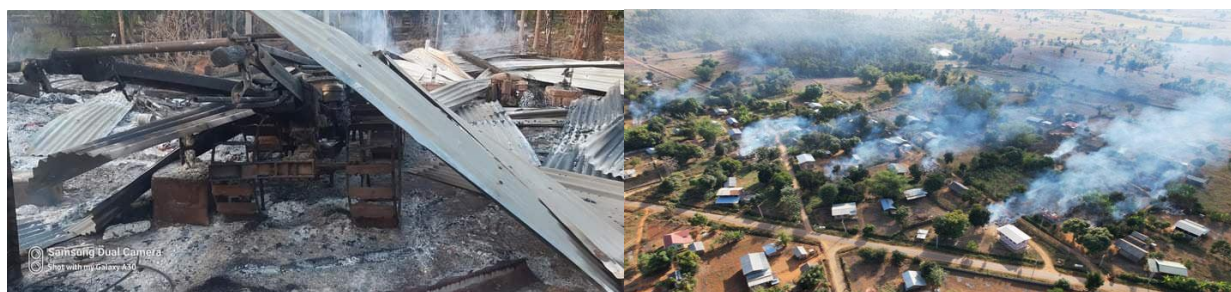
Houses in Naung Lon village, Loikaw township, intentionally set on fire by SAC troops

On December 18, according to local villagers and a KNDF statement, SAC troops indiscriminately shelled and shot into Naung Lon village, east of Lwe Le Lay town in Loikaw township, and intentionally burned down at least 11 houses in the village, while carrying out clearance operations in the area.