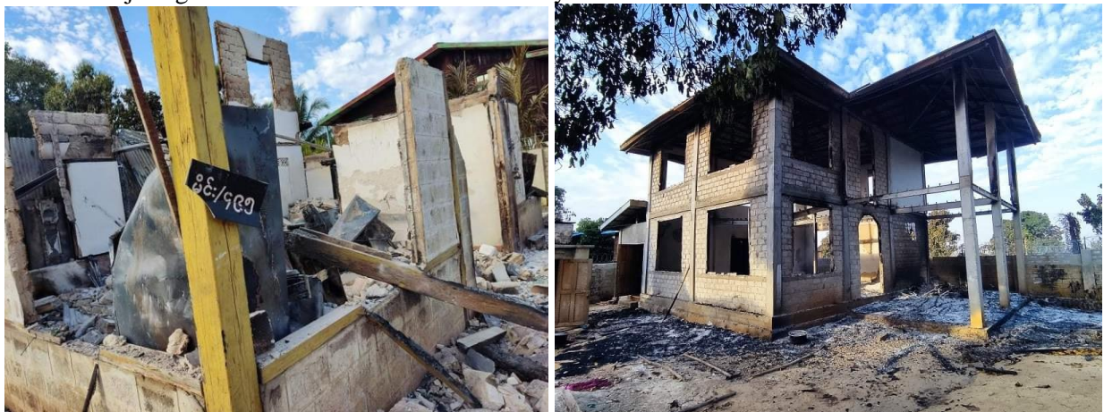
Villagers' houses torched by SAC in Mine Lone quarter, Loikaw town

On January 11, serious clashes occurred in Mine Lone and Ywa Dan She quarters in Loikaw town, killing 20 SAC soldiers and one KNDF soldier. In the evening SAC troops burned down some houses in Mine Lone. Two jet fighters bombed Loikaw town that day.