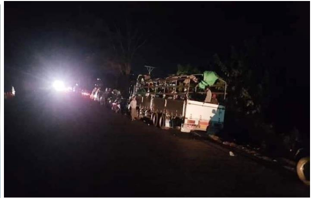
Civilians fleeing from Loikaw & Demawso blocked on the way to Taunggyi

On January 17, at 1 am, SAC aircraft dropped bombs over IDP camps in Pruso township, killing two girls (aged 12 and 15) and a 50-year-old man.