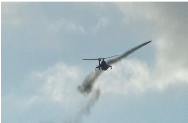
SAC helicopter shelling over Loikaw and Demawso

Since early January 2022, heavy fighting in the towns of Loikaw and Demawso, involving not only SAC ground attacks but also air strikes, have caused the town residents to flee to jungle IDP camps, as well as to other areas, including Shan State. IDPs fleeing from different townships including Loikaw have been obstructed by the SAC in various ways from entering Taunggyi, including by demanding exorbitant amounts of money along the main Loikaw-Taunggyi highway. In Loikaw town, after residents fled, SAC troops and other criminals have broken into empty houses and shops, stealing and ransacking property, inflicting further suffering on the displaced residents. Fear of airstrikes has caused about 20,000 residents of Loikaw town (about two-thirds of the town population) to flee, while residents of Demawso town who were formerly displaced, but tried to return to their homes, have now fled again, leaving the town almost deserted.