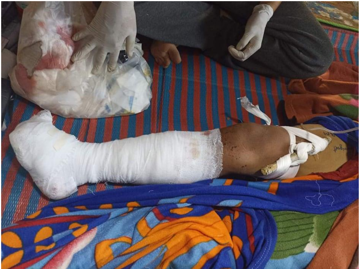
An injured child who stepped on a land mine planted by SAC in Loikaw town

On January 21, SAC burned down a house near the technical university in Mine Lone ward, Loikaw town. On the same day, a 17-year-old boy stepped on a land mine planted by SAC and lost his right leg while hunting birds near Peih Chit village in the Loikaw town area. Moreover, SAC troops who were carrying out an offensive near Daw Poe Si, 5-Mile, 6-Mile and Lo Bar Kho villages in Demawso township clashed with combined KA, KNDF and PDF troops. During the clash, SAC suffered many casualties while one KNDF soldier was killed. Two SAC jet fighters then carried out air strikes at 5:30 pm and 8 pm over Demawso.