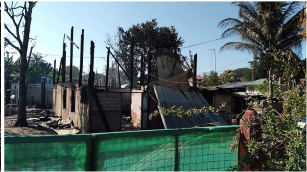
Houses torched by SAC in Daw U Khu ward,

On January 24, while carrying out an offensive, SAC troops clashed heavily with combined KA, KNDF and PDF troops in San Pya 6-Mile village tract the whole day, during which SAC used helicopters to carry out 3 air strikes.