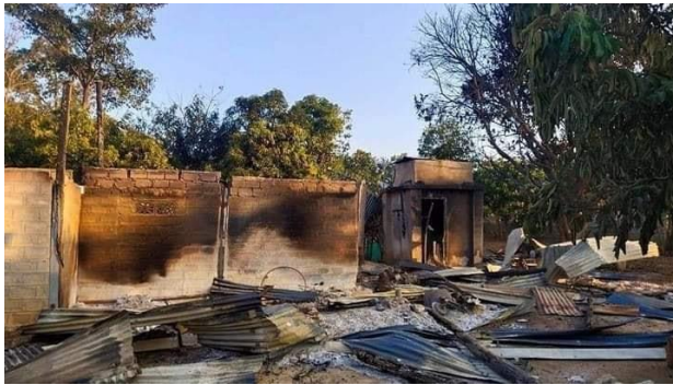
Houses torched by SAC in Htu Du Nga Ta village Loikaw

On January 23, a heavy clash occurred between KNDF and SAC troops near Ho Peit village and Thebyay Taw village in San Pya 6-Mile village tract in Demawso town, during which SAC burned down 9 houses in Ho Peit village, Thebyay Taw village and Sek Kwin 2 village. Moreover, the SAC killed two villagers in these villages.