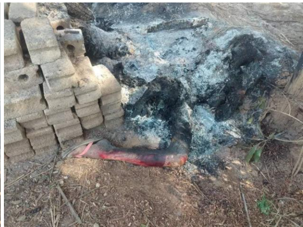
Two bodies, killed and burned by SAC in Pa Kyeh

On February 7, combined troops of KNDF BO 2, BO3, BO 11 and Pekhoh PDF clashed with SAC troops near Gone Thar village, Loikaw town, killing at least 9 SAC soldiers according to a KNDF BO 3 statement.