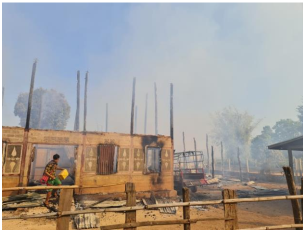
Houses damaged by SAC shelling in Loikaw

On February 4, SAC indiscriminately shelled into an area where many IDPs were sheltering, in Naung Palae village tract, Demawso township, injuring 3 men and 1 woman, and destroying 2 religious buildings, 2 cars and 2 houses.