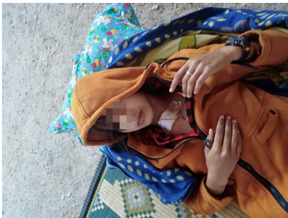
A young girl injured by SAC shelling

On February 17, heavy clashes occurred throughout the day in Moebye town, and at Haik Kwi dam and near Hwarisuplair village. Two SAC bren-carriers were damaged and 20 SAC soldiers were killed, while seven Moebye PDF soldiers were killed and six were injured. While heavy clashes occurred in Moebye town, the SAC used artillery, tanks and 2 jet fighters to bomb the town with seven airstrikes. Due to indiscriminate shelling by the SAC, two women and five men were injured, and one of them died. Moreover, five houses were burned and damaged. All the residents of Hwarisuplair village, where heavy clashes took place, fled from the clashes.