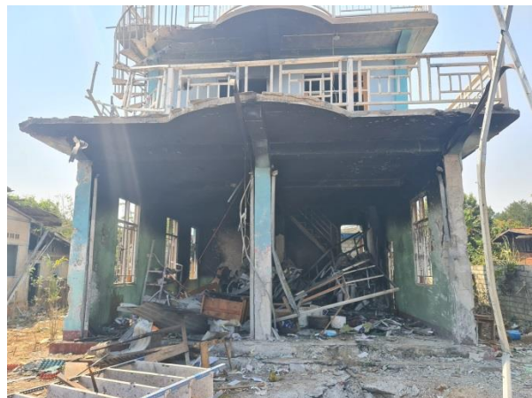
A house damaged by a SAC air strike

On February 18, a clash occurred in the north of Wee Theh Ku village killing at least 25 SAC soldiers, including officers, and injuring several others. During the clash, three Demawso PDF were injured and some soldiers from the alliance of combined troops were also injured, according to a Demawso PDF statement. SAC used two tanks during the attack against the Karenni armed forces, and two jet fighters also came at 4 pm and dropped bombs.