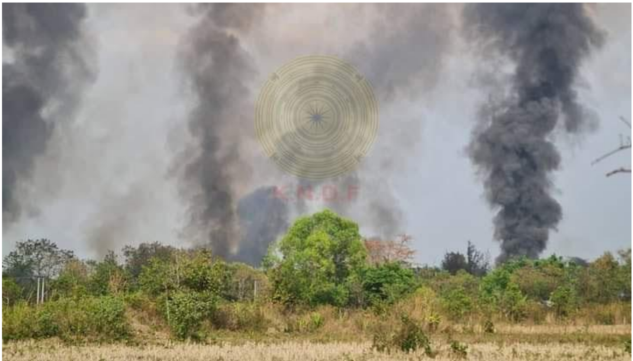
Houses torched by SAC in Thay Su Leh village

On March 5, SAC troops carrying out an offensive between Thay Hsu Leh village and Daw Naw Ku village in Demawso town clashed with combined Karenni troops, resulting in at least 35 SAC soldiers being killed, according to a Demawso PDF statement.