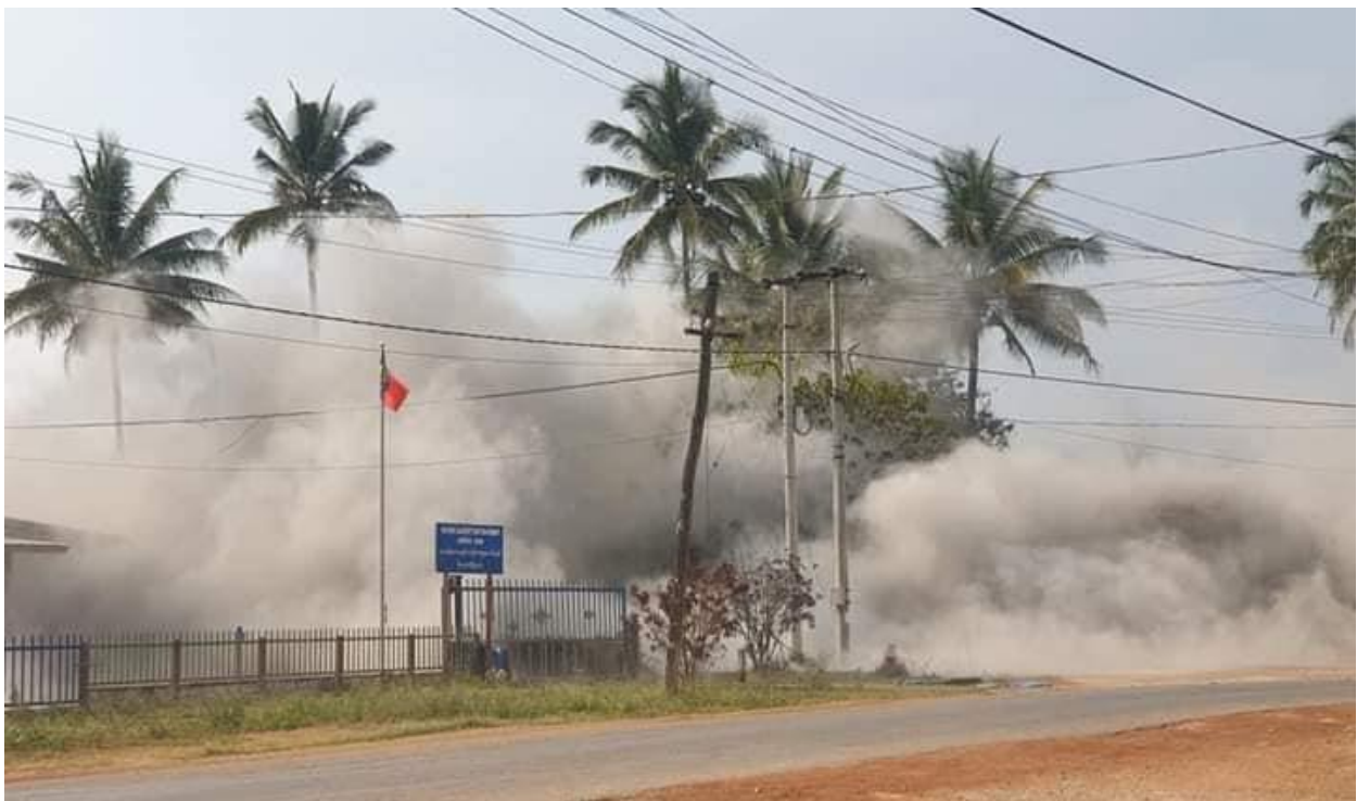
SAC shelling from a multiple rocket launcher in Daw Ngan Khan quarter, Demawso

According to KDNF sources, the multiple rocket launchers appear to have been used since February 16, when they started seeing multiple explosions. Sources say there are at least three multiple rocket launchers in Karenni State, including one at LIB 102, Demawso