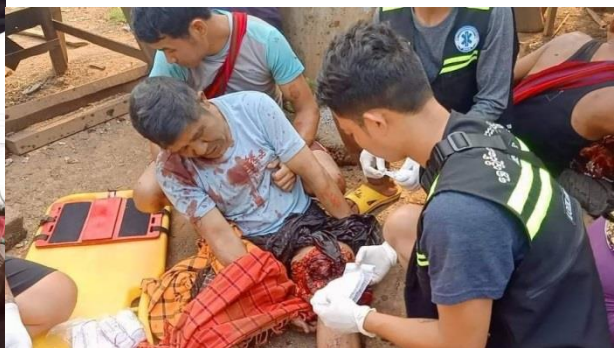
A villager injured by SAC shelling, Loikaw