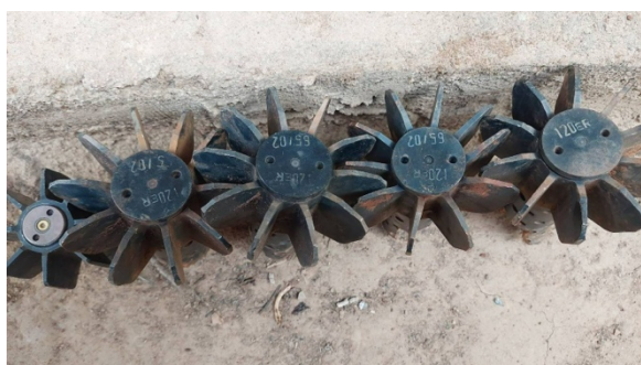
SAC artillery shells fired into eastern Demawso

On April 12, local Karenni resistance forces attacked SAC troops trying to repair a bridge during an offensive between Marcrawshay village and Lawja New Village, killing 8 SAC soldiers, destroying a pick-up car, truck and bulldozer, and seizing some ammunition. The SAC burned down two houses in Law Je Khu New Village, in Pruso township. At least 30 SAC soldiers were injured during clashes with combined KA and KNDF troops at U Ku Re village and Naung Paleh village in Demawso township according to a KNDF B-02 statement. The SAC launched 10 airstrikes during the clashes in Demawso township.