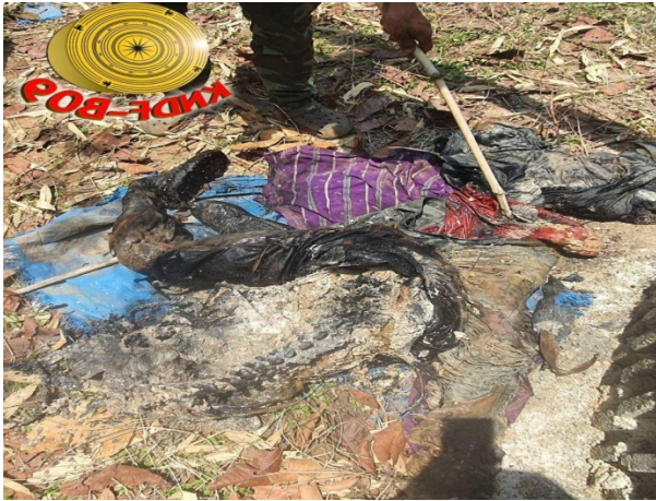
Two dead bodies found by KNDF in Zee Pyu Gone, Demawso township