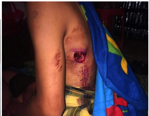
A Loi Pan So villager injured by SAC shelling

On May 21, from 1 pm to 4 pm, combined KNDF BO3, B11 and KA troops clashed with SAC troops in Hsee Mee Law village, eastern Pekhon township, killing 4 SAC soldiers. On that day, the SAC indiscriminately shelled into Nyaung Mone village, Kayin village tract, in eastern Pekhon township damaging a rice barn and some houses, even though there was no fighting in that village. On the same day, at 8 am, at Demawso Myoma bridge in Demawso township, the local PDF attacked a security outpost. Moreover, at 9 am the local PDF attacked SAC reinforcements on their way to Demawso Myoma bridge, killing 4 SAC soldiers.