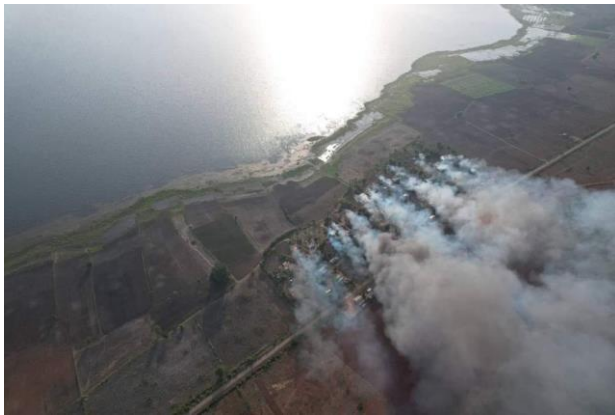
SAC torching the entire Hsaung Nan Keh village

On May 20, Karenni local PDF and SAC troops clashed from 8 am to 6 pm in Nan Porn Lon village in Pekhon township, where one local PDF soldier was killed. During the clash, the SAC troops burned down 3 houses in Nan Porn Lon village.