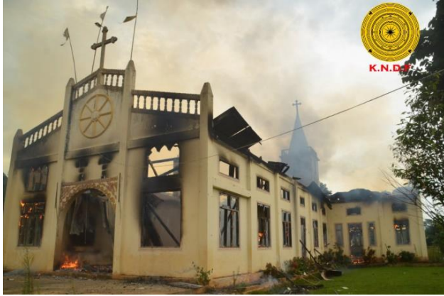
A Catholic church torched by SAC in Daw Nyein Khu, Pruso township