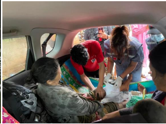
Civilian injured by SAC shelling in Demawso township

On June 15, a heavy clash occurred between SAC troops and PDF troops in Daw Nyein Khu village, Pruso township, killing 4 SAC soldiers. At 3 pm, the SAC then burned down Daw Nyein Khu Catholic church and the church hall.