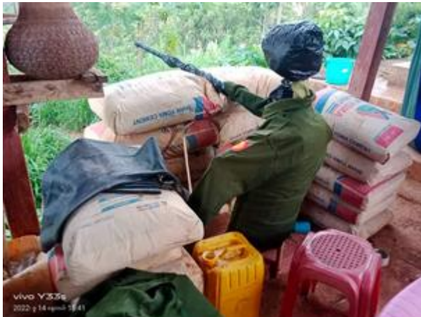
Scarecrow used by SAC to stand guard in Lweh Pao village, Pekhon

On July 4, at 5 am, SAC's Lweh Patar camp and Shwe Pyin Aye camp near Konesone village and Lweh Patar village, Pekhon township, were attacked by combined troops of KA, KNDF, PDF (Pekhon), MBPDF and SSRY. During the fighting, over 40 SAC soldiers were killed and 20 SAC guns seized. 11 troops of the combined forces were also killed. SAC troops arrested one civilian in Konesone village and burnt down his house, two cars and one motorbike. Additionally, the SAC shelled indiscriminately into Lweh Patar village, damaging a civilian house.