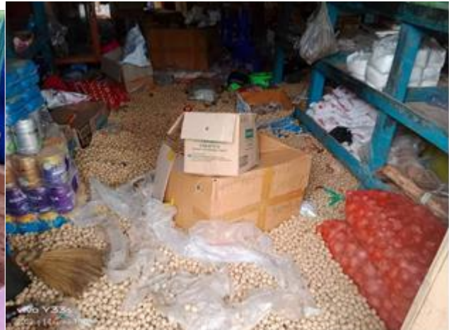
Shops destroyed by SAC troops in Lweh Pao village, Pekhon

On July 6, at 6 am, SAC's Thinbawbin camp near Lawpita village, Loikaw township, was attacked by KA and KNDF, and one SAC captain was killed. During the clash, a SAC fighter jet attacked 9 times and a helicopter 11 times. The SAC then sent reinforcement troops from No.1 camp, 4 Mile, Loikaw, which were ambushed by KNDF between Solaseh village and Lawkahtoo village, killing 5 SAC soldiers and injuring 4. During the fighting near Solaseh village, the SAC troops killed a Solaseh villager. In the afternoon, SAC troops were ambushed by KNDF near the SAC LIB 427 base at Ngwedaung village, Demawso, leaving 3 SAC soldiers dead and several injured. On the same day, the checkpoint at the bridge on the Pawn River in Bawlake was attacked by KNDF. The SAC troops shelled indiscriminately into Dawtamagyi village and Pehlyar village, Demawso township, even though there were no clashes there.