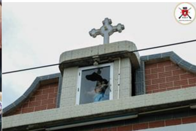
Catholic church damaged by SAC shelling in Moebye