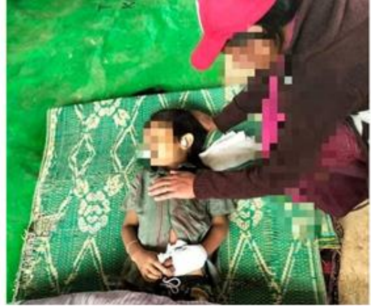
Young boy killed by SAC shelling, Moebye

On September 11, from 7 am to the evening, there were clashes between SAC and KNDF B-03, B-11, KA, Moebye PDF, Phekhon PDF, KRU, and URF in Point Khone 3 quarter, Moebye town; 20 SAC soldiers were killed, several injured and 2 troops from the Karenni combined forces were killed. During the clashes, SAC fired heavy artillery and launched two airstrikes. Due to the heavy indiscriminate shelling by SAC into Moebye town over four days, more than 100 civilian houses were damaged in Point Kone 1, 2, and 3 quarters.