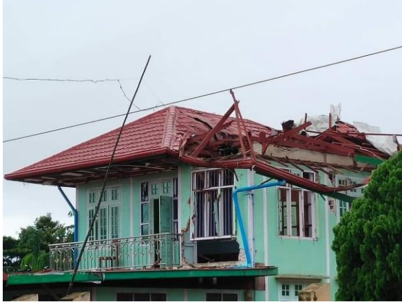
House damaged by artillery shelling in Moebye town

On September 10, from 11 am to 6 pm, there were clashes in Moebye town between combined Karenni troops and SAC, in which 11 SAC soldiers were killed, 11 SAC soldiers injured and 10 Karenni troops injured. At 3:50 pm, the SAC launched seven airstrikes, causing damage to several houses.