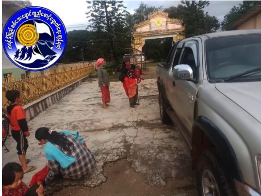
Civilians killed by SAC shelling in Moebye

HQ, Demawso PDF, Naypyitaw PDF, KNDF, KA, KGZ and URF; two Moebye soldiers were killed, while SAC casualties are unknown. Reports emerged that the SAC troops have used around 100 civilians as human shields in several temples during their raid on Moebye town.