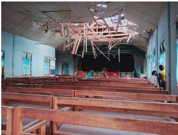
Church in Demawso damaged by SAC 120 mm shell

On September 30, at 8:45 am, a Myanmar National Airlines (MNA) plane was hit with gunfire while descending to land at Loikaw Airport. A passenger on the flight was hit and wounded by a bullet.