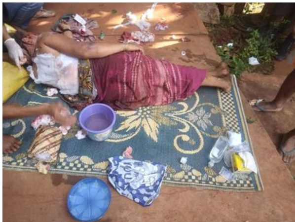
Civilian injured by SAC shelling in Khone Tar village, Loikaw

On October 2, SAC troops indiscriminately shelled about 30 times into civilian areas in eastern Loikaw township. Two shells damaged homes, but no one was injured.