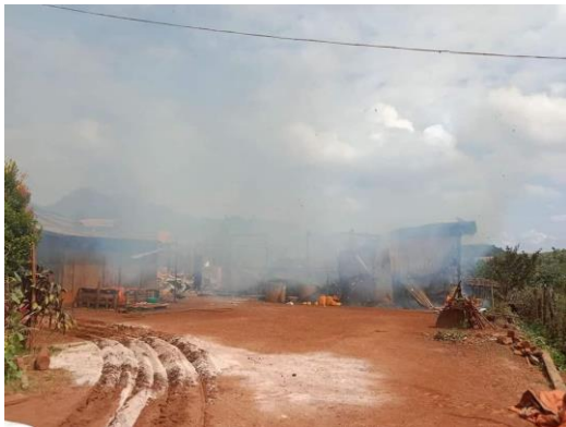
SAC shelling damaged a house in Khoneso village, Loikaw township

On October 27, KA and KNDF B-14 launched an attack on a SAC base near the Pawn River in Shadaw township. After the clash, indiscriminate shelling by SAC damaged a house in nearby Pawnchaung village.