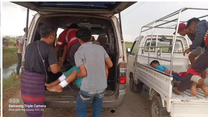
Children injured by SAC shelling in Pekinkawku village, Loikaw township

On October 29, a man riding a motorcycle was shot and injured by SAC troops on the Moebye–Loikaw main road. On the same day, at 1 pm, a civilian was injured when Karenni resistance forces and SAC troops clashed between Konetar and Saungkan villages, Loikaw township.