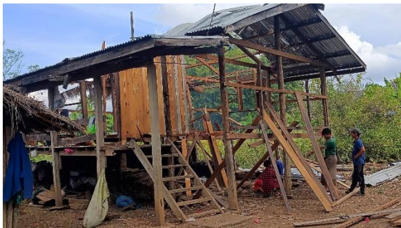
Building damaged by SAC shelling in eastern Moebye

On November 14, at 10:30 pm, Moby-based LIB 422 fired artillery into a village east of Pehkon Lake, injuring a 30-year-old man (in the stomach, leg and foot) and a seven-year-old child and damaging at least four houses. On the same day, SAC troops arrested a 32-year-old deaf man at Lawpitha village tract Loikaw township, and tortured him badly before releasing him.