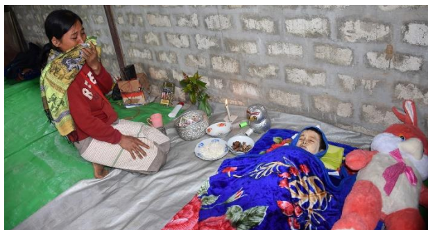
A child killed by SAC shelling in western Demawso

On November 15, indiscriminate artillery shelling by SAC troops in western Demawso township hit a nursery school where a family of war refugees was living, injuring nine family members, including a 5-year-old boy who was so seriously injured that he died of bleeding on the way to the hospital.