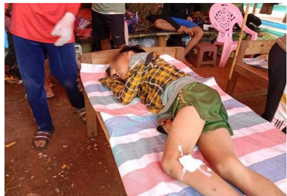
Children injured by SAC land mine in Moebye

On November 26, KNDF B-15 launched an attack on the SAC's military training school no.14 in Pruso township and on their Markrawshay outpost south of the training school, killing one SAC soldier.