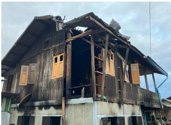
House burned by SAC shelling in Demawso

On November 25, KA and KNDF B-15 launched an attack on SAC's military training school no.14 in Pruso, killing three soldiers. At 7 pm, SAC troops from LIB 102 fired artillery shells more than 10 times into civilian areas in Demawso township, damaging a house and causing it to catch fire. On the same day, at 11 pm, indiscriminate SAC shelling injured a man in Loikaw township.