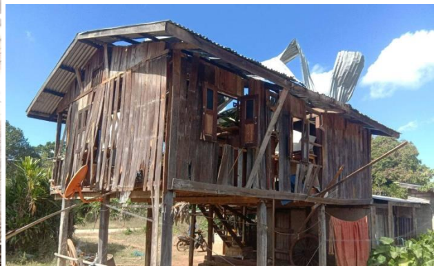
A house damaged by SAC drone bombing, Demawso

On December 13, 50 SAC soldiers clashed with KA and KNDF B-04 troops while carrying out an offensive to set up an outpost in Law Bu Dar quarter in Pruso town. The clash left one SAC soldier dead and one injured. On the same day, SAC carried out an offensive in Sapyat 6 Mile and Behtalin village, Demawso township, and clashed with KNDF B0-9 three times. During the clashes, 30 SAC soldiers were injured. After this, SAC torched several houses in Behtalin and Walatwar villages. On that day, indiscriminate shelling by SAC killed a man in Daw Seh village, Demawso township, and at 11 am, a 30-year-old woman was killed by a SAC artillery shell in eastern Demawso. At 8:50 pm, two electric pylons, no. 111 and 112, near Saw Kee Daw, Loikaw township, were blown up by a local PDF on the Shan-Karenni border. The two pylons were supporting a transmission line from Lawpita electric power station to Naypyidaw.