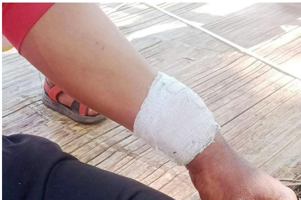
Civilian injured by SAC shelling, Pruso

On December 12, at 9 am, four SAC cars from Demawso-based LIB 427 were ambushed by KNDF B-09 in the way to Loikaw.