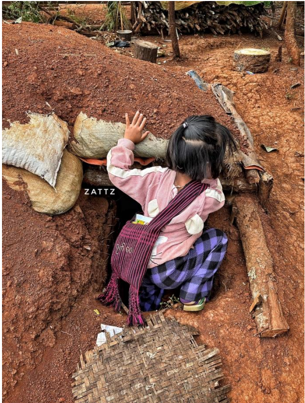
IDP student hiding from aircraft flying over Loikaw

On December 26, at around 8pm, although there was no fighting, SAC indiscriminately fired artillery shells into Lwehtamu village, Loikaw, damaging one house and injuring a 50-year-old man in his right arm.