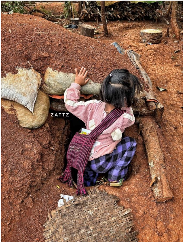
IDP student hiding from aircraft flying over Loikaw

On December 26, at around 8pm, although there was no fighting, SAC indiscriminately fired artillery shells into Lwehtamu village, Loikaw, damaging one house and injuring a 50-year-old man in his right arm.