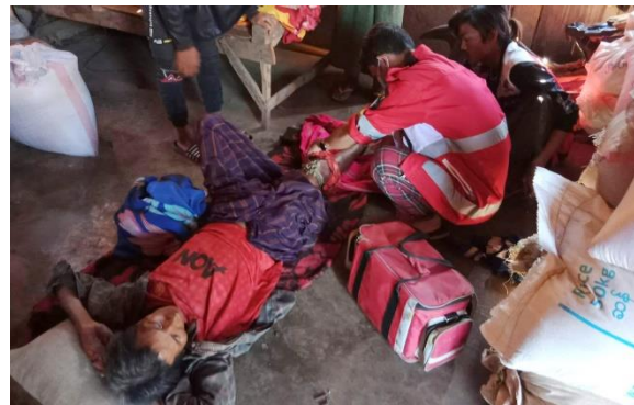
Civilian injured by SAC shelling in Daw Mu Kla, Loikaw township

On January 10, at 9 am, a SAC fighter jet flew over the western Kayan region for 30 minutes, causing children to run away from school and hide in fear.