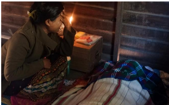
Civilian killed in Htwee Hso IDP camp, Demawso township

On January 8, at 8 pm, LIB 422 fired artillery at Pwetkone 1, Moebye town, killing a 66-year-old man.