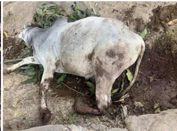
Villager's cow killed by SAC shelling, Demawso township

On January 23, at midnight, the SAC carried out an airstrike on an IDP camp in eastern Loikaw township dropping three bombs, which fortunately exploded outside the camp without injuring anyone.