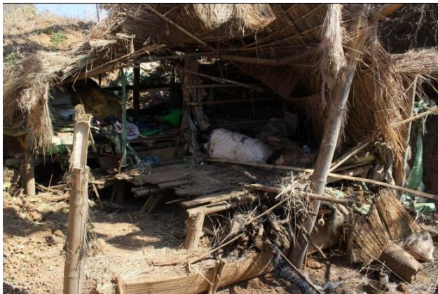
IDP shelter damaged by SAC shelling, Demawso township

On January 22, at 8 pm, Demawso-based LIB 102 fired artillery into an IDP camp in eastern Demawso township. Mortars hit the roof of one house and injured two children under 5 years old and a mother. The mother was wounded in both legs and a two-year-old child was injured in one leg and arm. On the same day, at midnight, the SAC carried out airstrikes, dropping two 500-pound bombs around an IDP camp in eastern Loikaw.