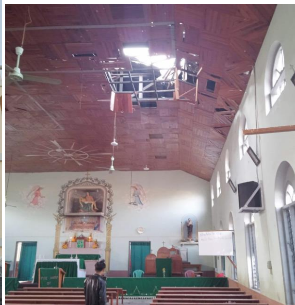
Catholic church shelled in Warikaungku village, Loikaw township

On February 6, at 2 pm, a civilian car hit a land mine on Zayapyu village road, killing four civilians and badly injuring two in Demawso township.