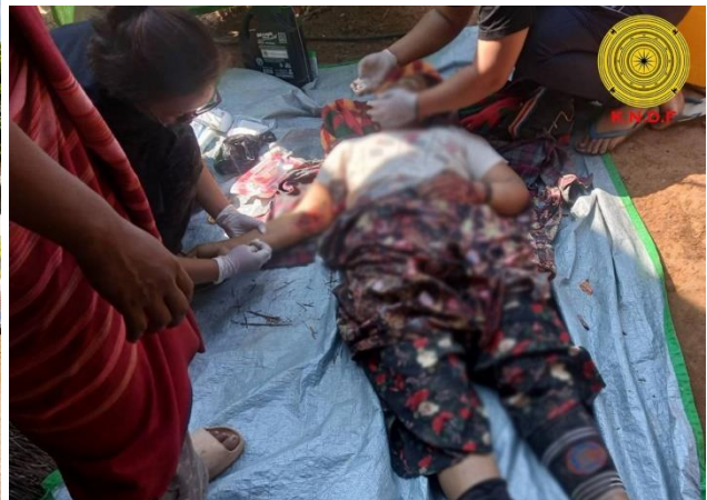
A woman killed by SAC shelling, Pinlaung township

On February 19, at 11 pm, KA and KNDF ambushed 30 SAC troops from LIB 54 carrying rations and ammunition between Huay Mar Kaw and Huay Khone Mow in Mese township, killing six SAC soldiers and arresting five including a company commander, as well as seizing some ammunition. On the same day, at 5 am, KRU launched an attack on SAC troops on patrol from an outpost in Khone Tar village, Demawso township, killing six SAC soldiers.