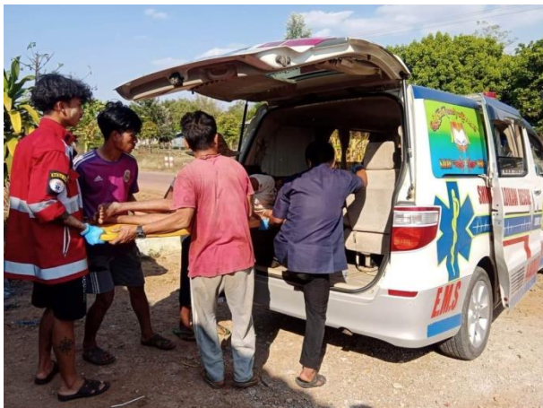
A man injured by SAC shelling, Loikaw township

On February 16, KA and KNDF ambushed SAC troops of LIB 531 while they were cleaning their base in Pruso township, killing one SAC soldier.