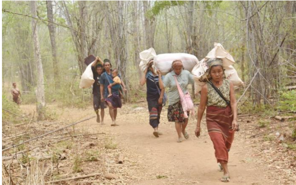
Villagers fleeing a SAC patrol in Demawso township

township. 19 SAC soldiers were killed and 6 SAC soldiers arrested; some ammunition was also seized. At 4 pm, the SAC attacked an outpost of KA battalion no. 3 near the Thai-Burma border. The attack was repelled, after which the bodies of 2 SAC soldiers were found. On the same day, at 5 pm, the SAC launched three airstrikes on Daw Seh village, Dawklawdu village tract, Demawso township. Also on the same day, at 4 pm, SAC troops raided Nam Nay village in Pinlaung township, killing 30 civilians and 3 monks, and burned down 50 houses.