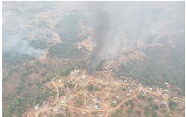
Houses burnt down by SAC in Pinlaung township

On March 12, the SAC indiscriminately fired artillery shells in Pruso township, despite there being no clashes at the time, injuring a 30-year-old woman and damaging three houses. Troops of SAC ID 66 patrolled into an IDP camp at the Shan-Karenni border, eastern Moby township, after which two burned corpses were found -- an 81-year-old woman and a 78-year-old man -- as well as the body of a grade 7 student who had been shot dead. On the same day, SAC troops burnt down 30 houses in Daw Ngay Khu village after clashing with combined Karenni forces in Day Ngay Khu village, Dawtamagyi village tract, Demawso township,