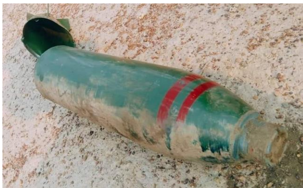
Bomb dropped by SAC aircraft, Loikaw township

On April 16, at 2 am, a SAC fighter jet dropped four bombs on Loi Le Lay village tract, eastern Loikaw township. On the same day, at 12 noon, SAC fired artillery shells eight times into IDP areas in western Demawso township, injuring a four-year-old girl.