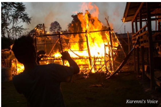
Damage from SAC jet bombing, eastern Demawso

On May 17, at 4 am, the SAC launched an airstrike on Sawlo village, Bawlake township, despite there being no clashes at the time. The bombs killed a 17-year-old girl, injured four men and damaged two medical buildings, six houses and a temple. On the same day, the SAC bombed three villages in Htee Phoe Kaloe village tract, Demawso township, including with 500 pound bombs, which damaged nine houses, a school and three barns.