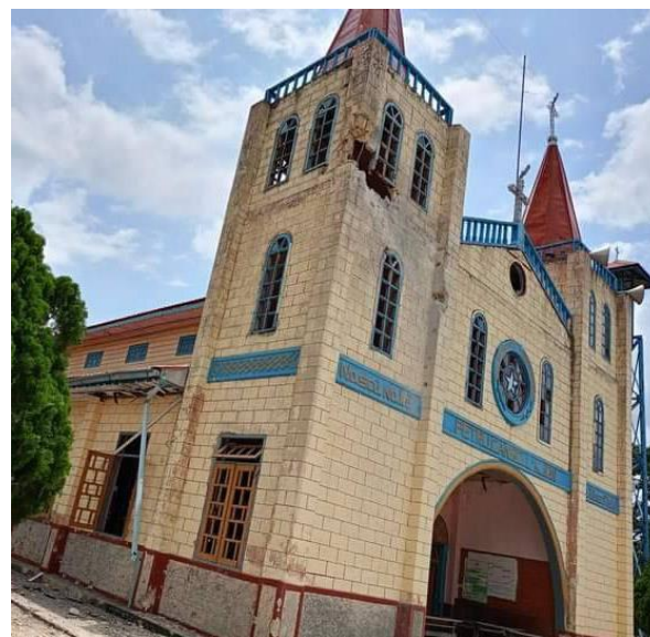
A religious building damaged by SAC shelling, Moebye

On June 10, there were heavy clashes between combined Karenni forces and SAC troops in Kaung Ei village, Phekon township, leaving two Karenni troops dead. At 7 pm, indiscriminate shelling by the SAC into an IDP area in western Demawso township damaged a house.