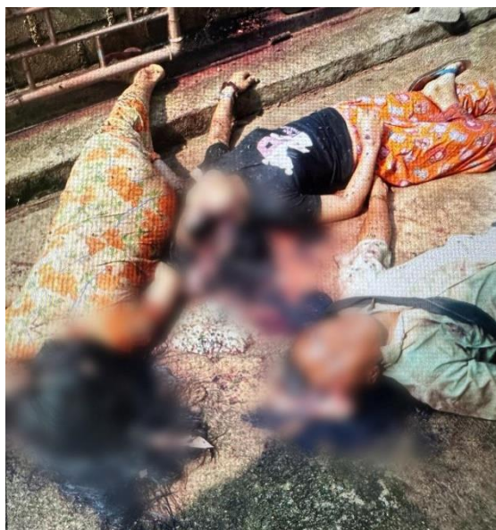
Civilians killed by SAC troops, Moebye town

On June 8, at 4 pm, a SAC tactical battalion based in Bawlake town fired artillery shells at Le Won village, Sawlo village tract, killing a 29-year-old man and damaging a house. On the same day, at 7 pm, SAC LIB 530 fired five artillery shells into Htee Se Khan village, Loi Len Lay sub-township of Loikaw township, injuring a man, damaging a construction store and igniting its contents including thirteen million kyat in cash.