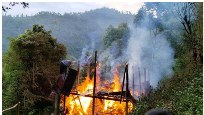
House ignited by aerial bombing in western Pruso township