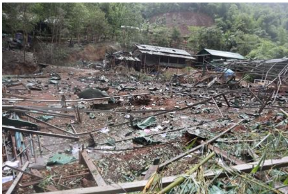
Damage from airstrike on Daw Noe Ku IDP camp

In the morning of July 12, SAC troops travelling on a convoy from Moebye to Loikaw shot randomly at civilians, killing three people, including a 17-year-old boy.