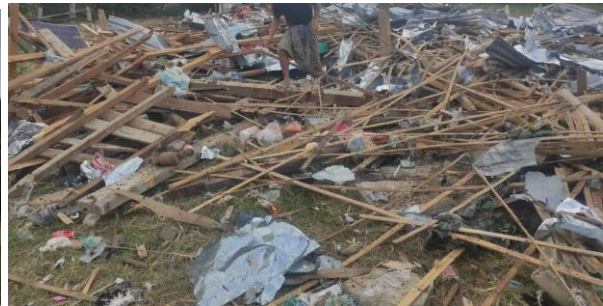
A church damaged by SAC bombed, Htee Taw Ku village, Pruso township Building damaged by SAC bombed and shelled Demawso township

On Aug 10, at 2:00 pm, the SAC bombed two times to the area that the Karenni combined force and SAC clash occurred and again at 4:15 pm in a village, damaged some building in Demawso township.