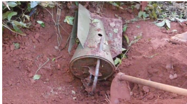
Civilian killed by SAC artillery shell, Loikaw township SAC aerial bomb dropped on civilian area, Demawso township

On September 8, at 1 pm, SAC aircraft dropped three bombs, including a 500 pound bomb near Saung Pway IDP camp in Pekhon township, damaging some houses and injuring a woman in her hand. Due to the ongoing reinforcement of SAC troops along the main road from Pruso to Bawlake, the central committee of KNDF announced on September 8 that the public should not use this road