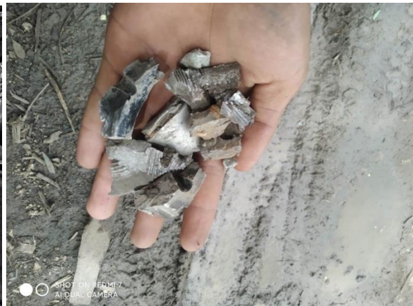
SAC shell fragments, Demawso township

On September 19, at 7 am, the SAC aircraft dropped bombs near Kyat Ku cave, in eastern Loikaw township. On the same day, at 11 pm, SAC aircraft dropped bombs near IDP camps in western Pekhon township, damaging some tents and injuring some civilians. Moreover, SAC aircraft dropped bombs in the west of Shay Sa Khan IDP areas and Khone Tar village between Loikaw and Pekhon townships. On the same day, the combined Karenni forces clashed with SAC troops in Daw Po Shay village, injuring 9 Karenni soldiers.