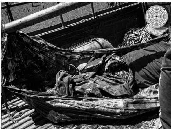
Woman who died from stepping on a SAC landmine, Pruso township

On September 18, at 11:40 pm, the SAC indiscriminately fired artillery shells into western Demawso township. Five shells exploded in a village, killing a 37-year-old woman, and injuring a 42-year-old man and a 12-year-old girl. On the same day, combined Karenni forces clashed with SAC troops between Loikaw township and Shadaw township. During the clash, the SAC fired multiple rocket launchers into the clash area. On the same day, the Moebye PDF announced that civilians should not use the Moebye-Nan Mekhon-Demawso road as the SAC was using it for transportation of its military supplies.