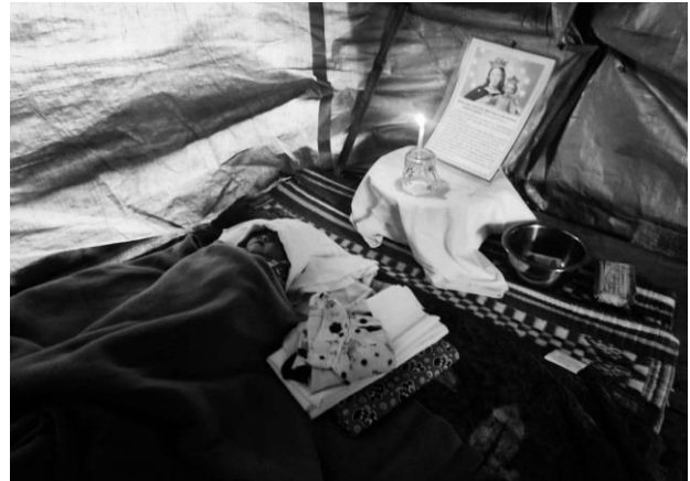
A seven-day-old baby who died after SAC shelling

On October 19, a 30-year-old man in Loikaw who had been arrested and beaten by SAC troops of IB 72 on October 3, 2023, died of his injuries in Mandalay hospital.