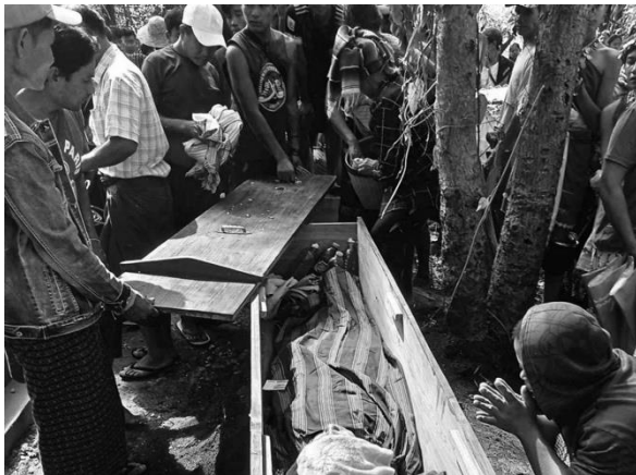
A villager who died from SAC torture

On October 15, at 7 pm, the SAC fired seven mortar shells into IDP areas in western Demawso township, damaging some IDP shelters.