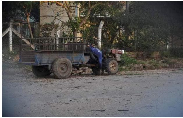
SAC aerial bombing damage in Loikaw town