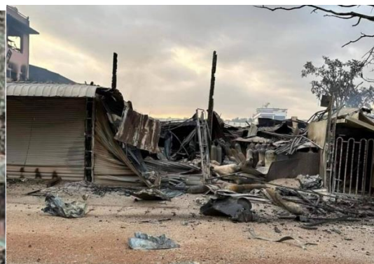
Building damaged by SAC shells in Loikaw town

On December 14, the SAC carried out four aerial bombings in Loikaw, specifically targeting Badoh ward, an area without direct fighting. As a consequence, civilian homes were destroyed by the bombing.