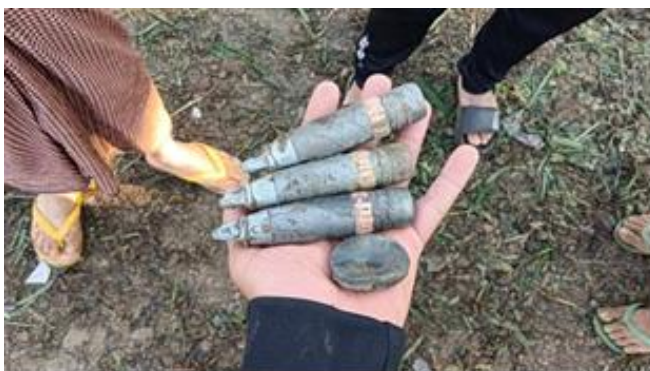
SAC aerial bombs, west Demawso township

On the morning of December 12, intense fighting erupted between the SAC army and combined resistance forces in Loikaw town. SAC Battalion 54 relentlessly fired heavy artillery at Daw U Khu village and Naung Yar village. By 11 pm, the Golden Loikaw Welfare Association office in Loikaw, along with seven ambulances and nearby houses, was set ablaze due to the SAC's heavy artillery fire. Residents fleeing the conflict from Minelon Ward in Loikaw returned briefly to retrieve essential belongings, resulting in two fatalities and one injury from SAC shelling.