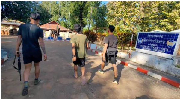
Combined Karenni forces seizing Pekhon police station

On January 8, at 7 pm, combined Karenni forces launched an attack on a SAC outpost set up in Khone So temple, Pekhon township, killing ten SAC soldiers and seizing the outpost.