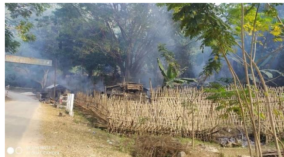
Incendiary bombing by SAC drones in Loikaw town Combined Karenni forces torching SAC outpost, Mawchi

On January 25, incendiary bombs dropped by SAC drones caused the Two-Storey Market in the market quarter of Loikaw town to burn down.