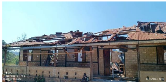
School bombed by SAC aircraft, Demawso township

On February 5, at 10:15 am, SAC fighter jets dropped bombs on Daw Si Ei village in Demawso township, including a 500 pound bomb, killing four children and injuring 29 students. At around the same time, a SAC fighter jet dropped bombs on Loi Nan Pan village, about three miles from Daw Si Ei village, killing a man, and injuring two teachers and five other civilians. The airstrikes in both villages damaged six school buildings, a church, five houses and a car