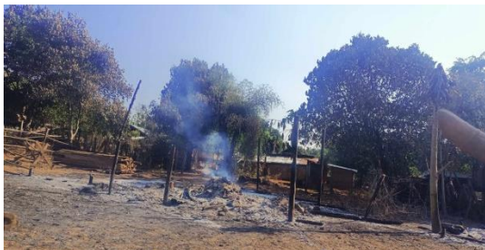
Civilian home burned down by SAC airstrike, Shadaw town

On February 4, sixty-four SAC troops from IB 249 based in Mong Pying, Ho Pong township, Shan State, were transported in three helicopters into a jungle area north of Shadaw town. These SAC troops came across seven displaced civilians in the jungle: one man, three disabled women, including one who was pregnant, and three children. The SAC troops arrested them, and then, the next morning, shot dead all seven IDPs, including the children. Later that day, combined Karenni forces attacked the SAC troops who had perpetrated this crime, killing 40 SAC soldiers. In retaliation, a SAC fighter jet bombed around the fighting area. The airstrikes during this time damaged 40 homes in Shadaw town.