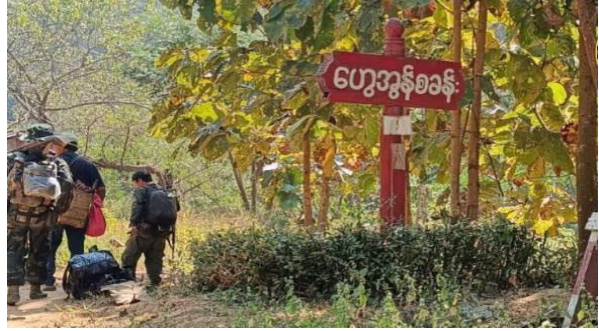
Abandoned SAC outpost east of Salween, Shadaw township

On February 14, the Interim Executive Council Karenni State announced the start of a passenger vehicle service running four days a week between Demawso, Mawchi and Mese townships.