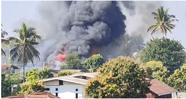
SAC incendiary bombs, Loikaw town

On February 13, at 2:30 pm, despite there being no clashes in Pekhon township, the SAC indiscriminately fired artillery shells into Shwe San village, killing a 17-year-old IDP student, and two women residents aged 30 and 50. On the same day, SAC troops from LIB 135 and IB 54 abandoned two outposts east of the Salween River; they were airlifted out by four helicopters.